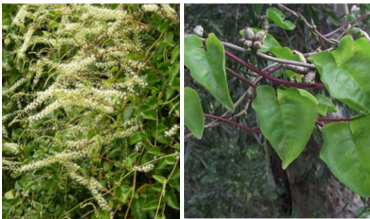
Madeira Vine with its distinctive heart-shaped leaf with reddish stems.

This pesty creeper has reddish stems with small irregular 'warty' aerial tubers. The leaves are heart shaped, glossy, clammy to the touch, and arranged alternately on the stems. It's flowering about now, with lots of slender, drooping, cream-coloured flowerheads about 18 cm long.